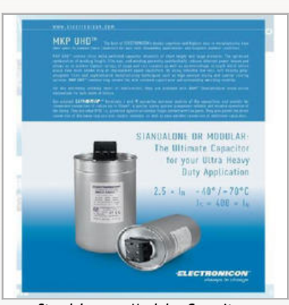
Standalone or Modular Capacitors