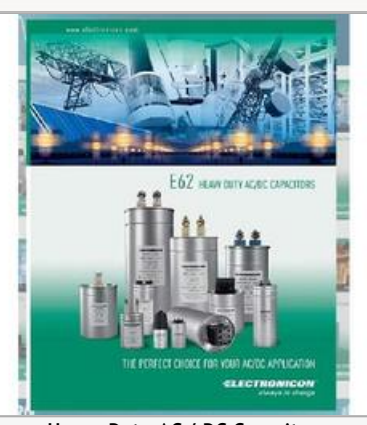
Heavy Duty AC / DC Capacitor