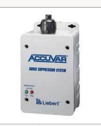
Transient Voltage Surge Suppressor