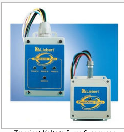
Transient Voltage Surge Suppressor